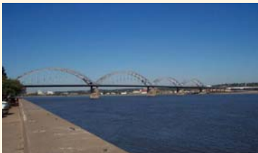
Davenport, IA and Rock Island, IL

The Quad City Area (Rock Island, IL and Davenport, IA) has lots of interesting attractions, minor league sports, and lots of great restaurants. Visit http://www.visitquadcities.com/ to learn more about the area.